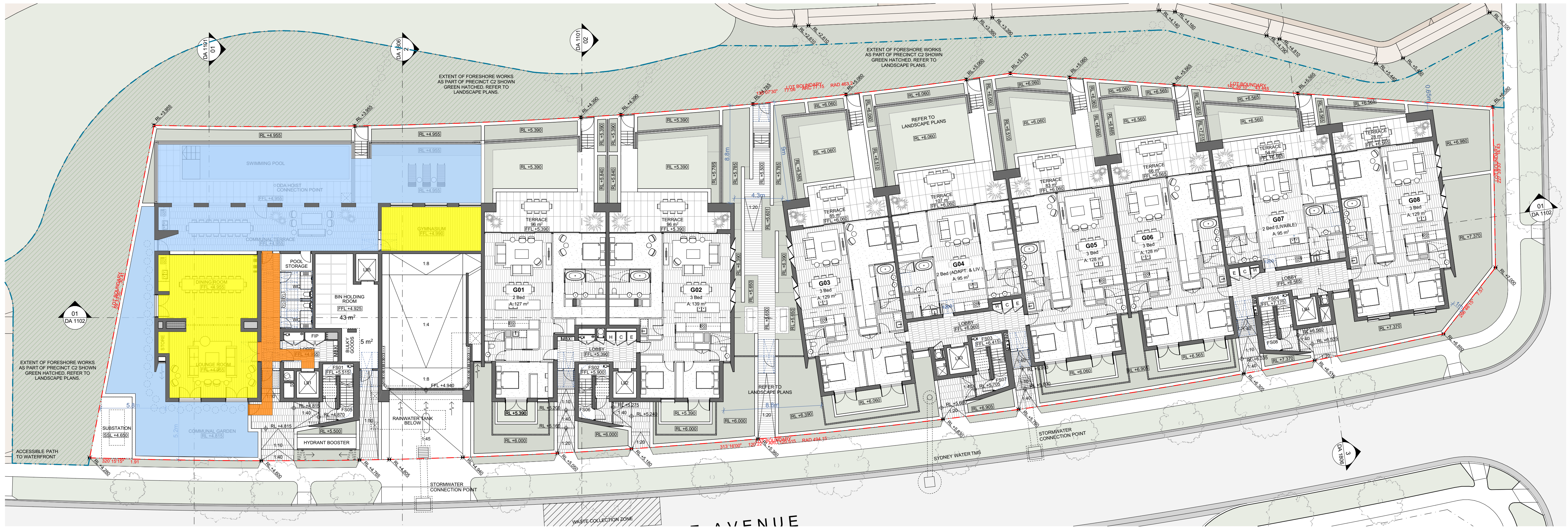
1 Communal Space & Access Paths- Ground Floor 1:200